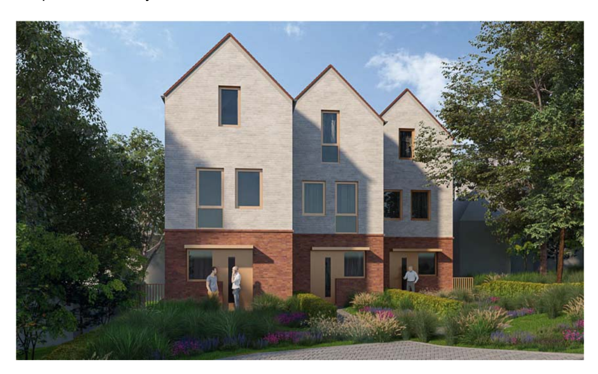
Site and Surroundings

spaces to the front of the site, with associated landscaping. Each property would have private amenity to the rear. The site would be accessed via Roke Road.