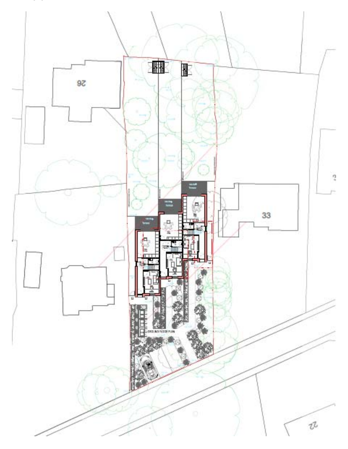
Neighbouring properties to the north, south and north east

Overall it is considered that the proposal complies with the requirements of Policy DM10.6 of the Local Plan.