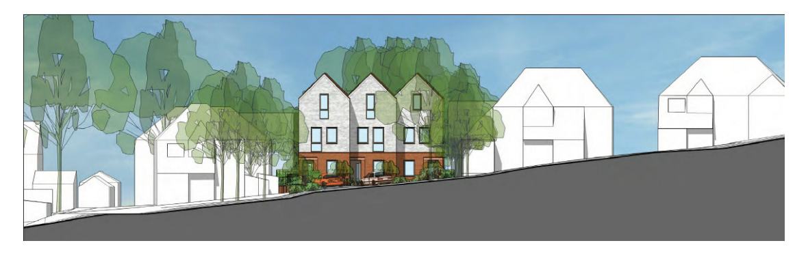
Proposed streetscene elevation - Roke Road

Extract from Suburban Design Guide SPD (surrounding buildings 2 storey detached)