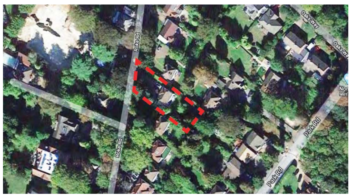
Aerial view of site